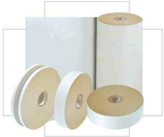
(Rolls in various sizes and thicknesses)