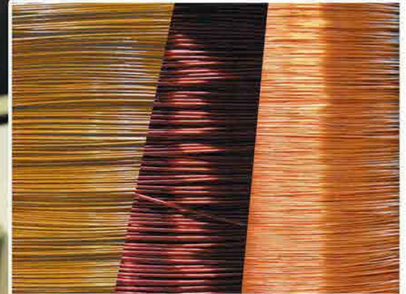
(Examples of different copper types)

MAFEL , with over thirty years of experience and knowledge in the electromechanical sector, electric motors, transformers, electric pumps, etc., manages the agency and the distribution of Enamelled copper wire TERM200, SALD180, BOND200 (self-cementing) and other types of special copper wire, such as the one specially designed for inverter powered motors.