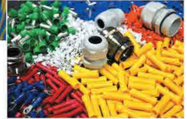
(cable terminals and connectors)